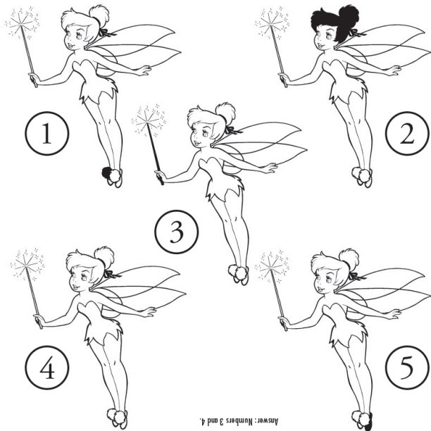
Answer: Numbers 3 and 4.