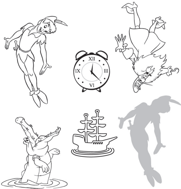
Answers: Peter Pan and Shadow, Captain Hook and Ship, Crocodile and "Ticking" Clock.

Draw a line between the character and the right object and then color everything in!